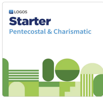
Pentecostal & Charismatic Starter