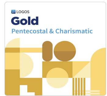
Pentecostal & Charismatic Gold