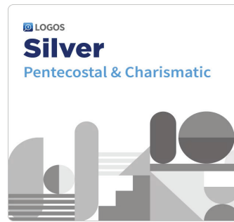
Pentecostal & Charismatic Silver