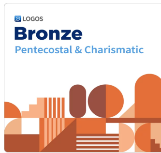
Pentecostal & Charismatic Bronze