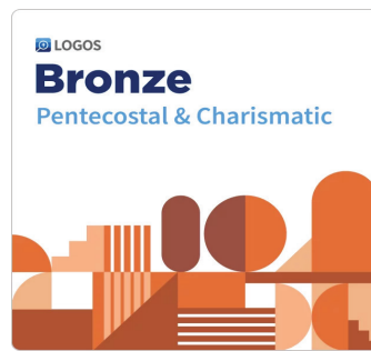
Pentecostal & Charismatic Bronze