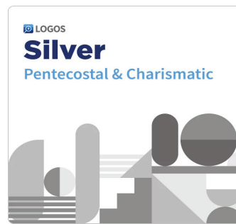
Pentecostal & Charismatic Silver