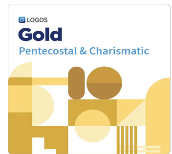
Pentecostal & Charismatic Gold